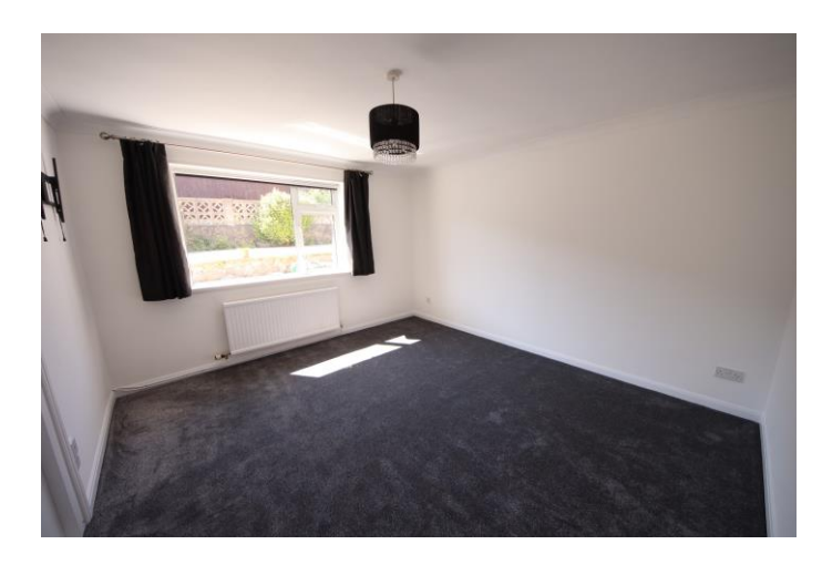
BEDROOM 2 - 3.25m x 2.95m (10'8" x 9'8") With radiator, uPVC double glazed window, wash hand basin, coved ceiling, built-in wardrobe.