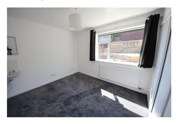
BEDROOM 3 - 3.66m x 2.54m (12'0" x 8'4") With coved ceiling, radiator, uPVC double glazed window.

BATHROOM White suite comprising panelled bath with shower over, wash hand basin with bathroom cupboard under, close coupled W.C, ladder style heated towel rail, coved ceiling, uPVC double glazed window, tiled walls.